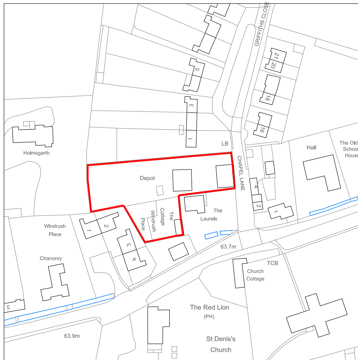
LOCATION PLAN 1:1250 @ A1