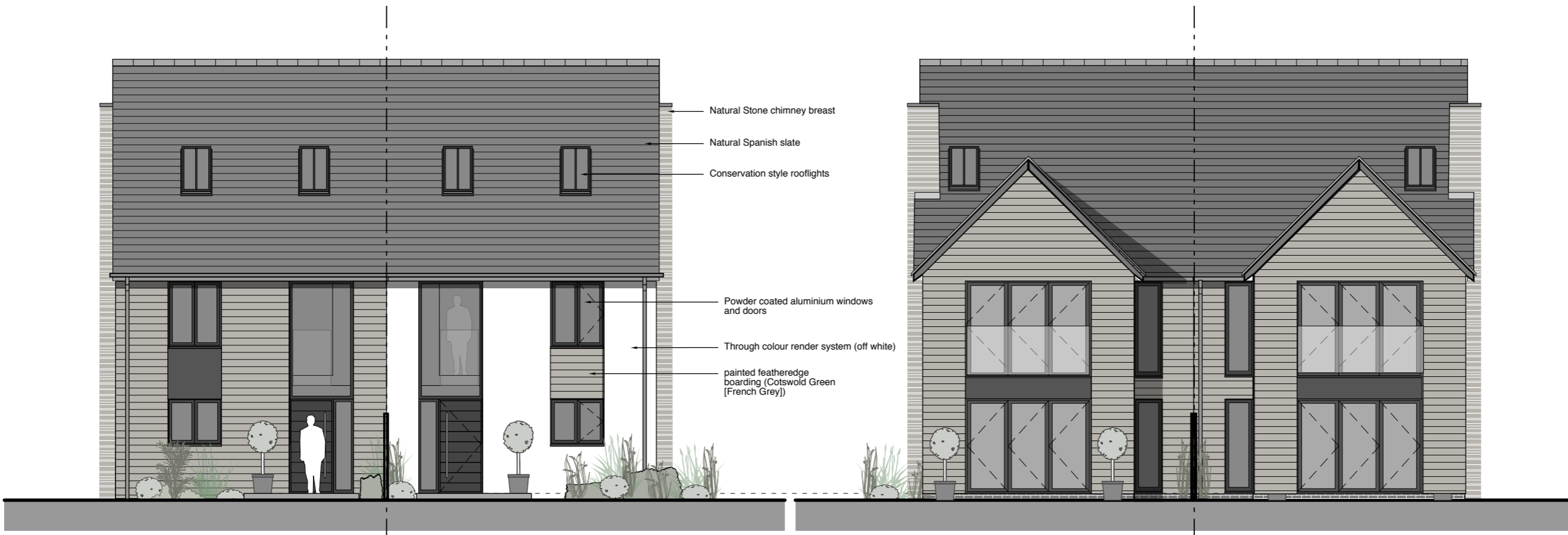
FRONT ELEVATION (East) UNIT 1